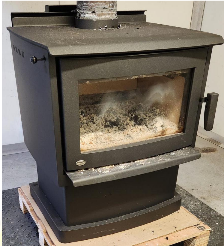
Figure 1: Appliance during testing.