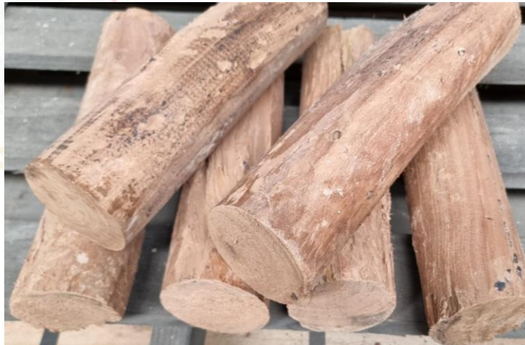
Figure 2: Test fuel load.