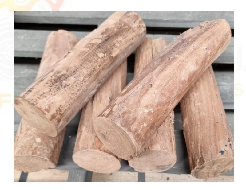
Figure 2: Test fuel load.