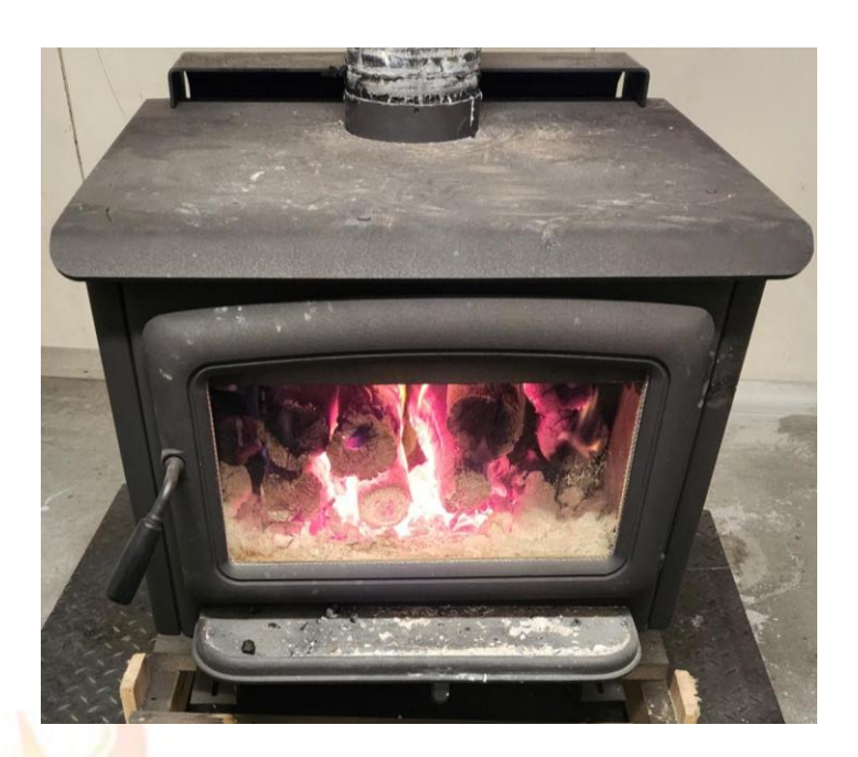
Figure 1: Appliance during testing.