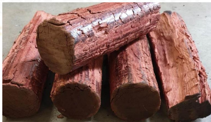
Figure 2: Test fuel load.