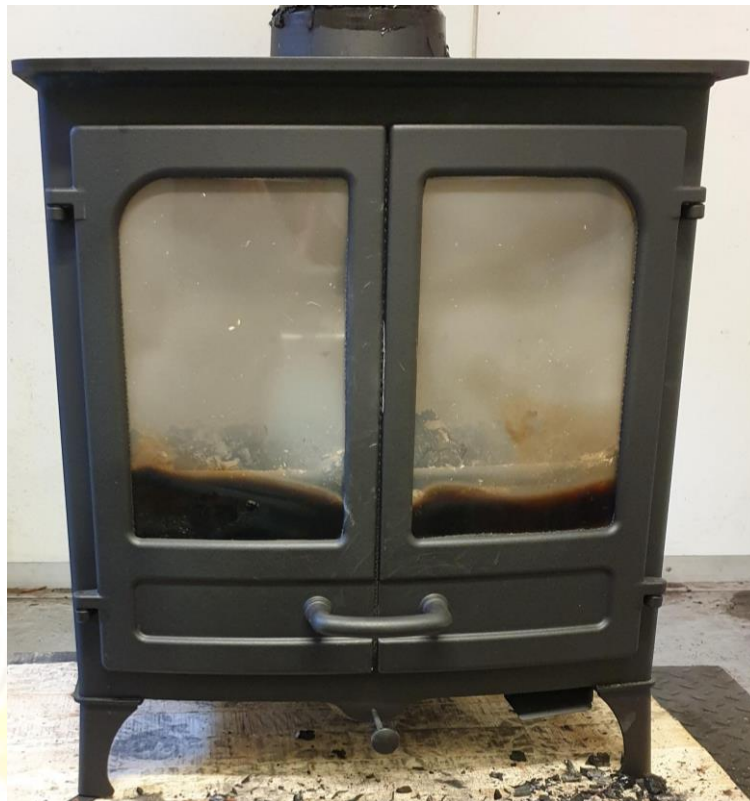
Figure 1: Appliance during testing.