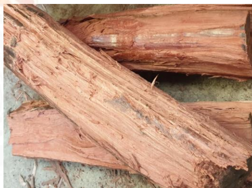
Figure 2: Test fuel load.