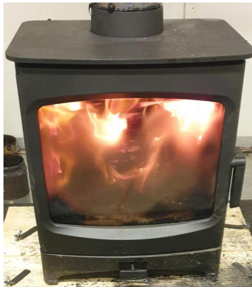
Figure 1: Appliance during testing.