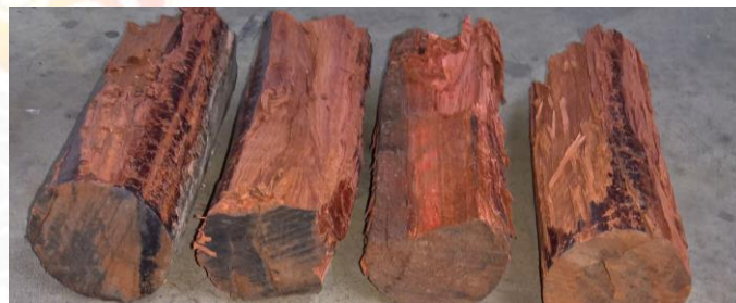
Figure 2: Test fuel load.