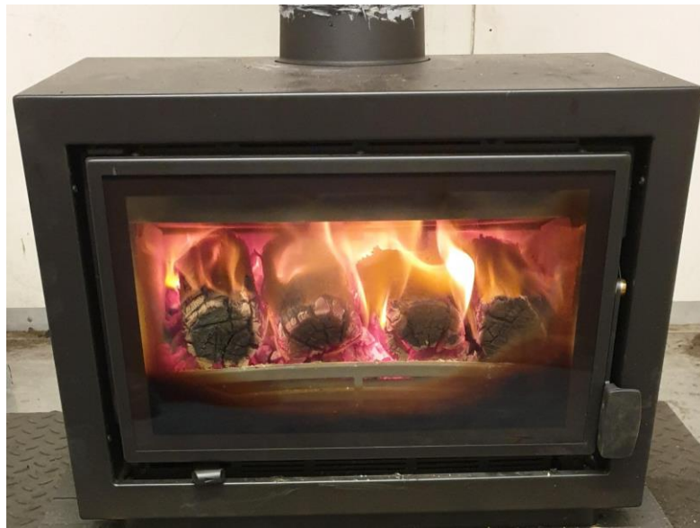
Figure 1: Appliance during testing.