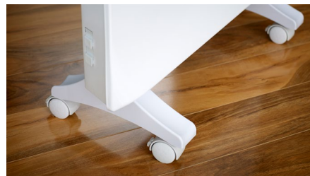
Attachable castor wheels for easy mobility