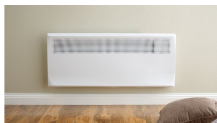
1500W model wall mounted