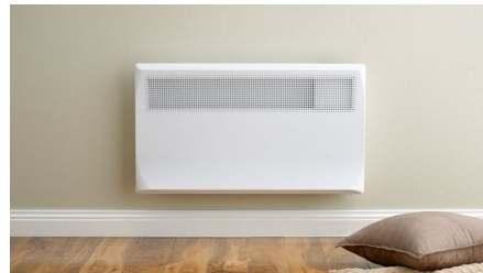
2200W model wall mounted