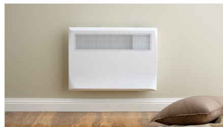
1000W model wall mounted