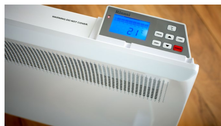
Integrated control panel