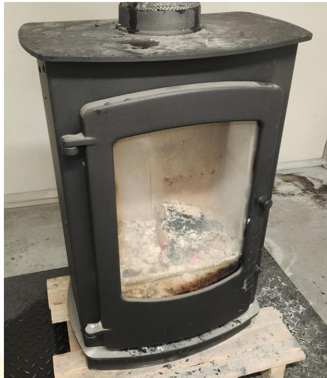
Figure 1: Appliance during testing.