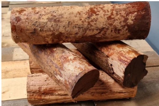
Figure 2: Test fuel load.